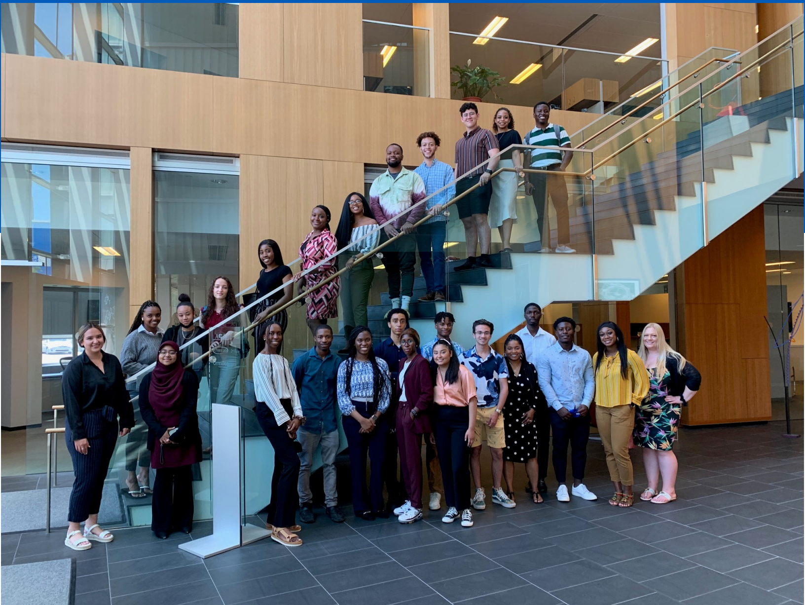
2022 CSTEP Research Interns at the Hauptman-Woodward Institute