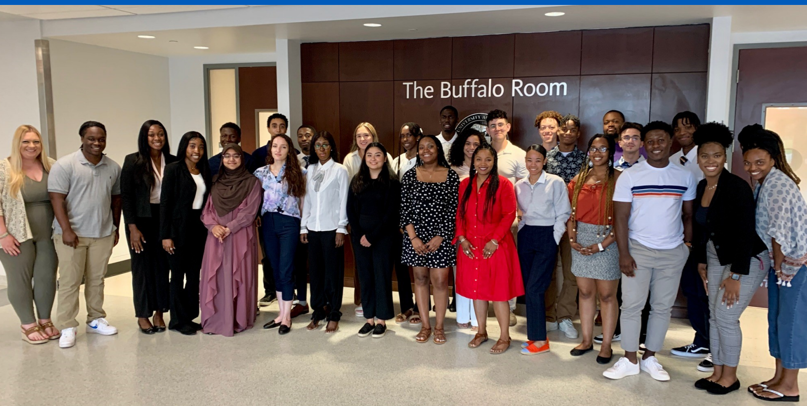
2022 CSTEP Research Interns on UB North Campus